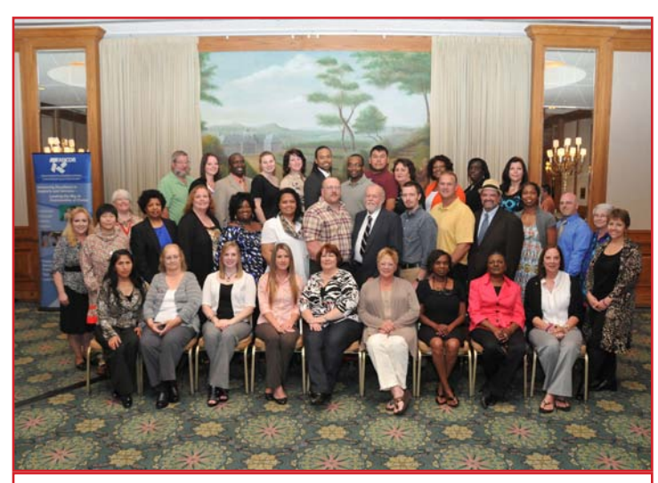
The 2012 DSPs of the Year who were able to attend the ANCOR 2012 Conference: Leading Cultures of Innovation & Advocacy

Short bios of the 2012 class of Legacy Leaders can be found here.